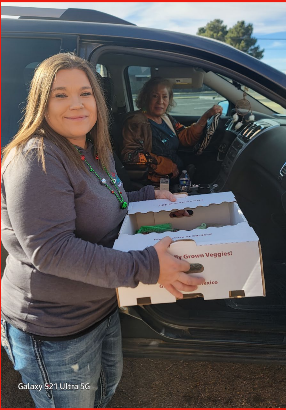
Galaxy S21 Ultra 5G